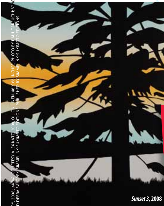
Sunset 3, 2008

port. It was fascinating to see different types of people. I came from a middle class neighborhood in Queens. Every day you can get out and the water is another color. That was really fantastic.