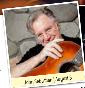
John Sebastian | August 5