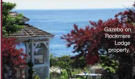
Gazebo on Rockmere Lodge property.

Breathtaking sunrises from Rockmere Lodge. Located in a quiet residential area.