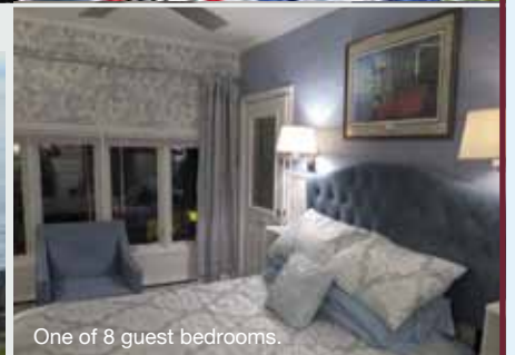
One of 8 guest bedrooms.