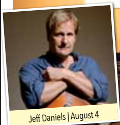
Jeff Daniels | August 4