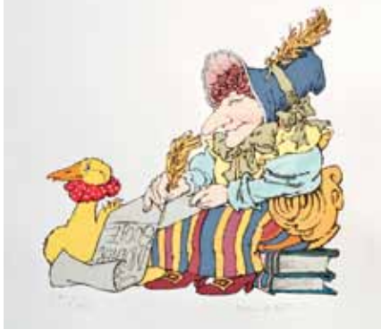
Maurice Sendak, Mother Goose

UNE Portland Campus • 716 Stevens Avenue, Portland • (207) 221-4499 www.une.edu/artgallery • Wed, Fri, Sat & Sun 1–4 p.m., Thurs 1–7 p.m.