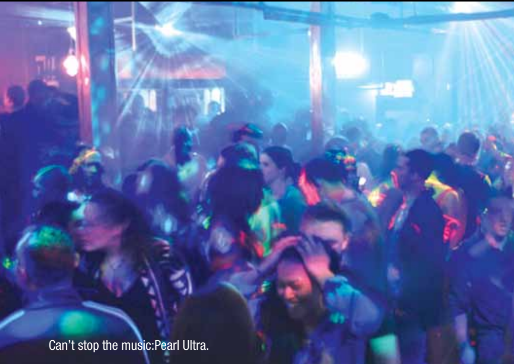
Can't stop the music: Pearl Ultra.