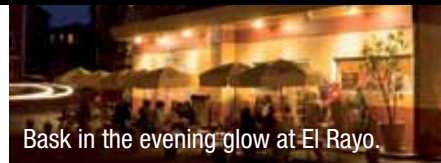
Bask in the evening glow at El Rayo.

Find Styxx few blocks down Spring from Little Tap House and Flask, a bar with something for everyone. Two levels of dance floors!