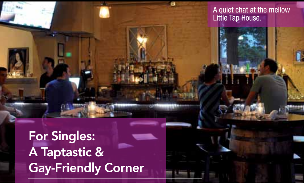
A quiet chat at the mellow Little Tap House.