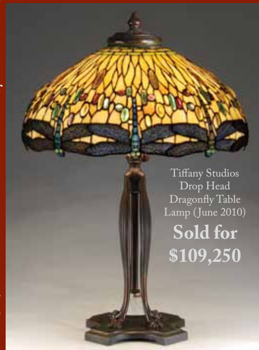
Tiffany Studios Drop Head Dragonfly Table Lamp (June 2010)

World record for the most expensive map ever sold at auction.