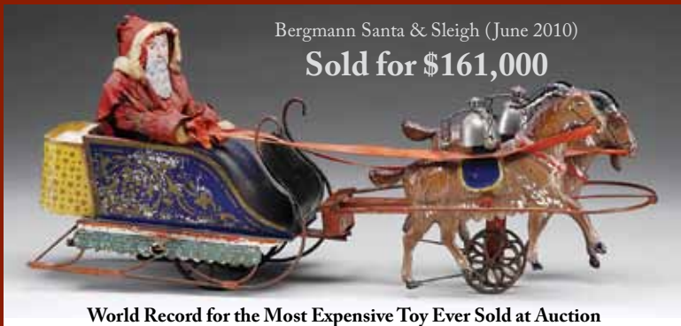
Bergmann Santa & Sleigh (June 2010)