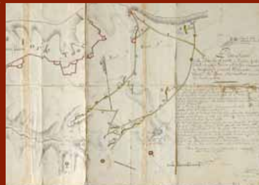
Washington's personal map for siege of Yorktown. (Feb 2010)