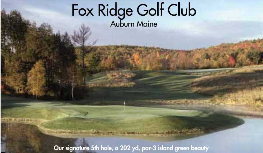
Our signature 5th hole, a 202 yd, par-3 island green beauty