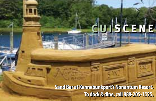
Sand Bar at Kennebunkport's Nonantum Resort. To dock & dine, call 888-205-1555.