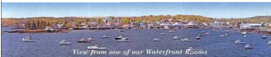
View from one of our Waterfront Rooms

Brown's Wharf is a resort hotel, restaurant, and marina that offers visitors luxury waterfront accommodations. We are a family owned and operated business that has been hosting travelers in Boothbay Harbor since 1944. With water views from every room, Brown's Wharf Inn offers spectacular sunsets and beautiful flowers. Our "over-the-water" restaurant offers only the best in dining for the past 67 years.