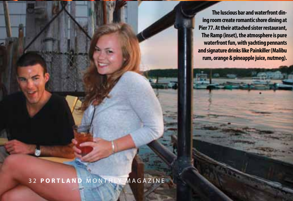
The luscious bar and waterfront dining room create romantic shore dining at Pier 77. At their attached sister restaurant, The Ramp (inset), the atmosphere is pure waterfront fun, with yachting pennants and signature drinks like Painkiller (Malibu rum, orange & pineapple juice, nutmeg).

The lobster fleet shimmers at its moorings as Fidelity V , propelled by three black 300-hp Mercury outboards, takes a conspicuous turn at the bell buoy and heads with boyhood familiarity into Cape Porpoise Harbor.