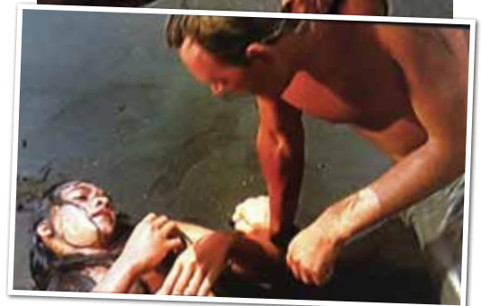
STILLS FROM MUTINY ON THE BOUNTY - METRO - GOLDWYN - MAYER