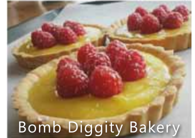
Bomb Diggity Bakery