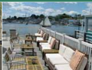
Comfortable Deck for Cocktails & Views of the Harbor