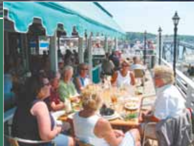
Inside & Outside Dining