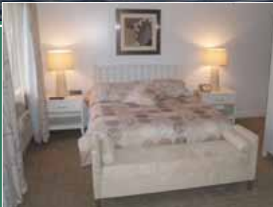
New - Suites!

GREAT FOOD • GREAT DRINKS • GREAT VIEWS GREAT PLACE TO STAY!