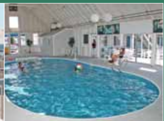
Indoor Heated Pool

633-4455 • 1-800-ROC-TIDE • (1-800-762-8433) • rocktideinn.com