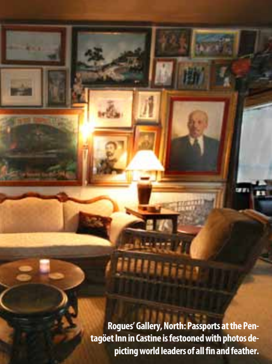
Rogues' Gallery, North: Passports at the Pentagöet Inn in Castine is festooned with photos depicting world leaders of all fin and feather.

Your stay here will evoke a sense of world diplomacy.