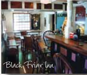
Black Friar Inn