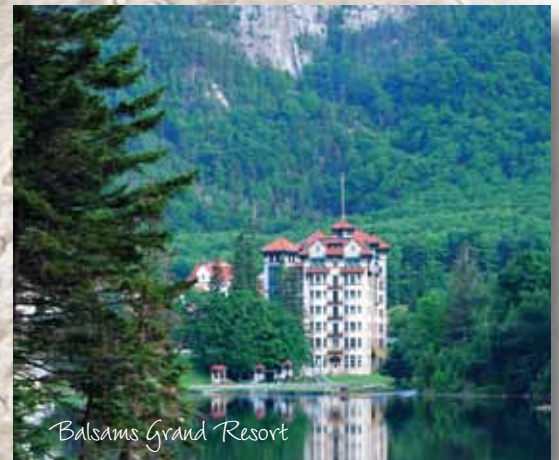
Balsams Grand Resort