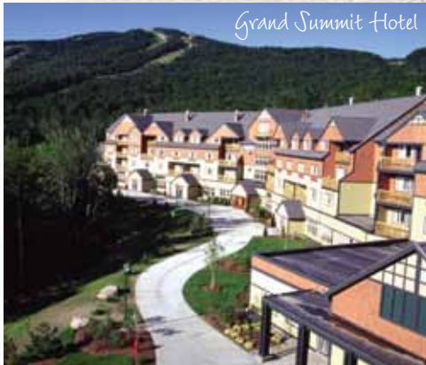
Grand Summit Hotel