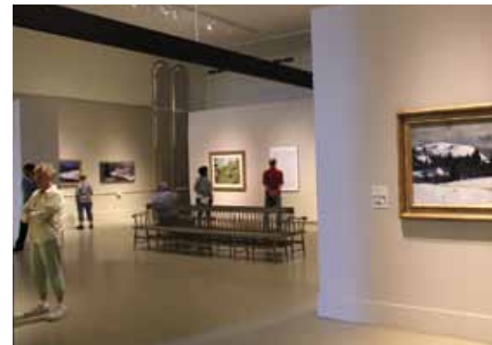
The open sanctuary of the former United Methodist Church is now sectioned with walls for art at the Wyeth Center gallery at the Farnsworth Art Museum.

a church works. [In 2009], they created this culinary event , with the kitchen located where the altar was. The attempt is to make the food sacred. There’s beautiful ductwork above the kitchen. It rises in the manner that the interior of a Gothic church rises, and that’s brilliant engineering.