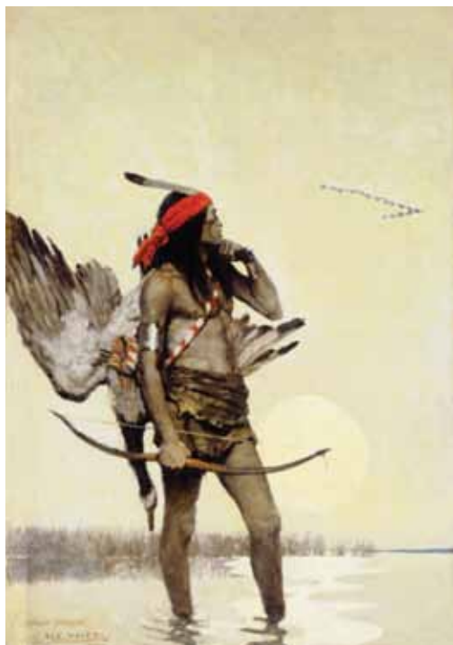
N.C. Wyeth, The Hunter , 1906; oil on canvas, 38 7/8 x 26 5/8 in.; collection of the Brandywine River Museum

Exhibition sponsors: Anna Mae and George Twigg III